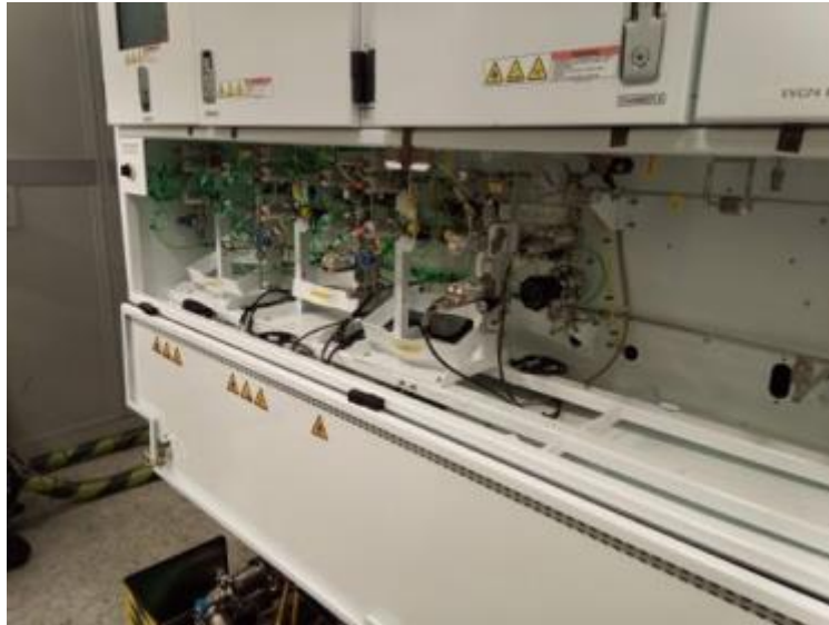
Precursor gas box