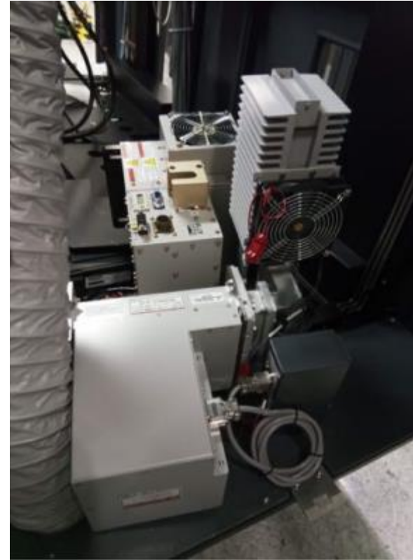
Microwave generator & waveguide